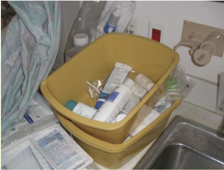
Figure Typical storage of bath basin. Note upright storage, sink, and used incontinence tubes.

the direct exposure to the bacteria that can occur if a contaminated basin is used for bathing. It is reasonable to anticipate that patients who are immunocompromised or who have open wounds would be at risk for infection after direct exposure to contaminated bathing materials. Any activity that potentially spreads antibiotic-resistant bacteria from a contaminated surface to the skin works directly against efforts to eradicate such bacteria from the hospital or health care environment.